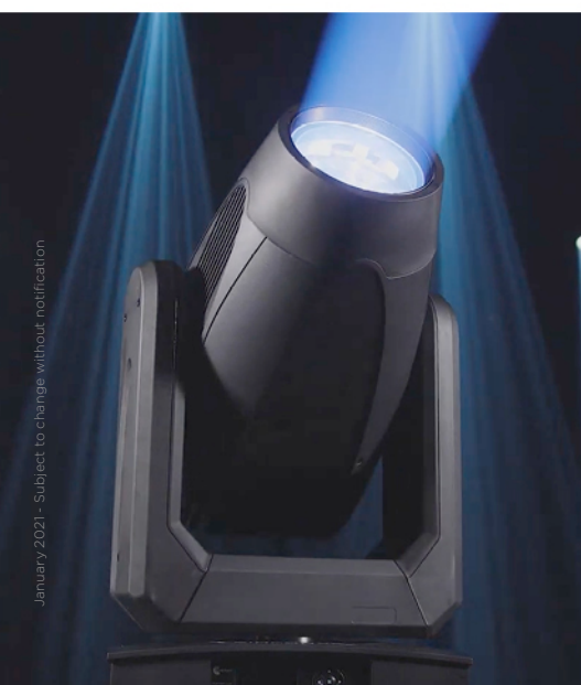
January 2021 - Subject to change without notification

Claypaky have found a new solution to the old industry issue.